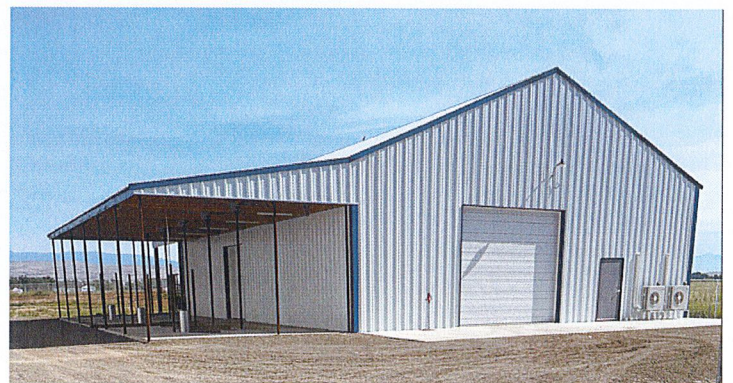
Vo-Ag Livestock Pavilion